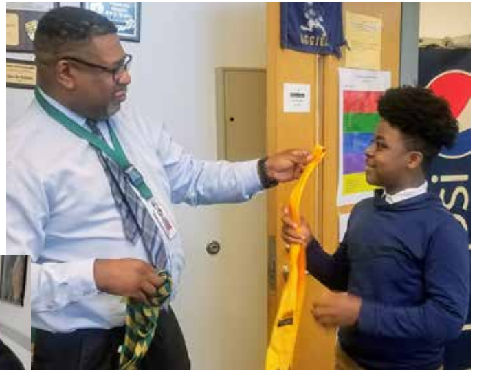
(above) As a Faculty and Staff at WYMLA, we are honored and proud to work with and for future generations of our brightest and most promising young leaders in America! (left) One WYMLA brother helps another remember the steps of tying a tie on WYMLA's 'Well-Dressed Wednesday.'

Student applications are reviewed and scored based on a rubric. If there are more applicants than seats available, the Student Assignment Department will utilize a lottery system for seat and wait-list assignments.